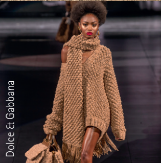
Dolce & Gabbana